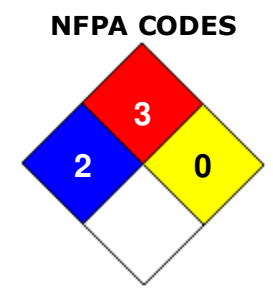
NFPA 30 / 30B Storage Classification: Level 2 Aerosol